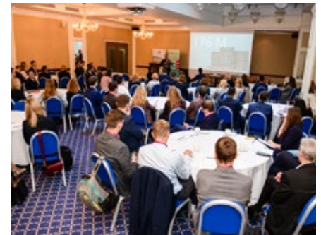
Informal Members' Get-Together Events in Vilnius and in Kaunas