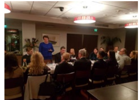
SCCL Seminars: Sustainable Business: How to go Green | Doing Business in Sweden | Business Mission - What's up