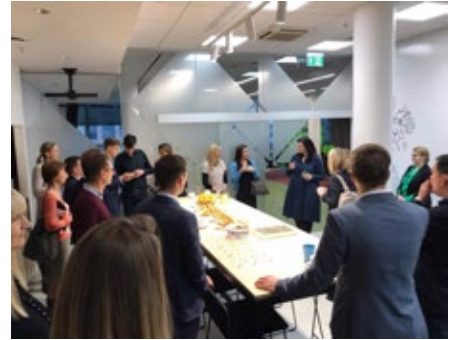
7th European Banking & Finance Conference Future Banking